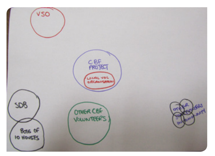
Figure 2. Stakeholder mapping exercise

During this exercise, the community volunteers placed the local implementing partner (local vol organisation) within the project circle because they felt they controlled decisions about project activities. The community volunteers (depicted by the green circle), placed themselves at some distance from the centre because they perceived themselves to have little influence in relation to the project, despite the importance they placed on their role (indicated by the size of the circle).