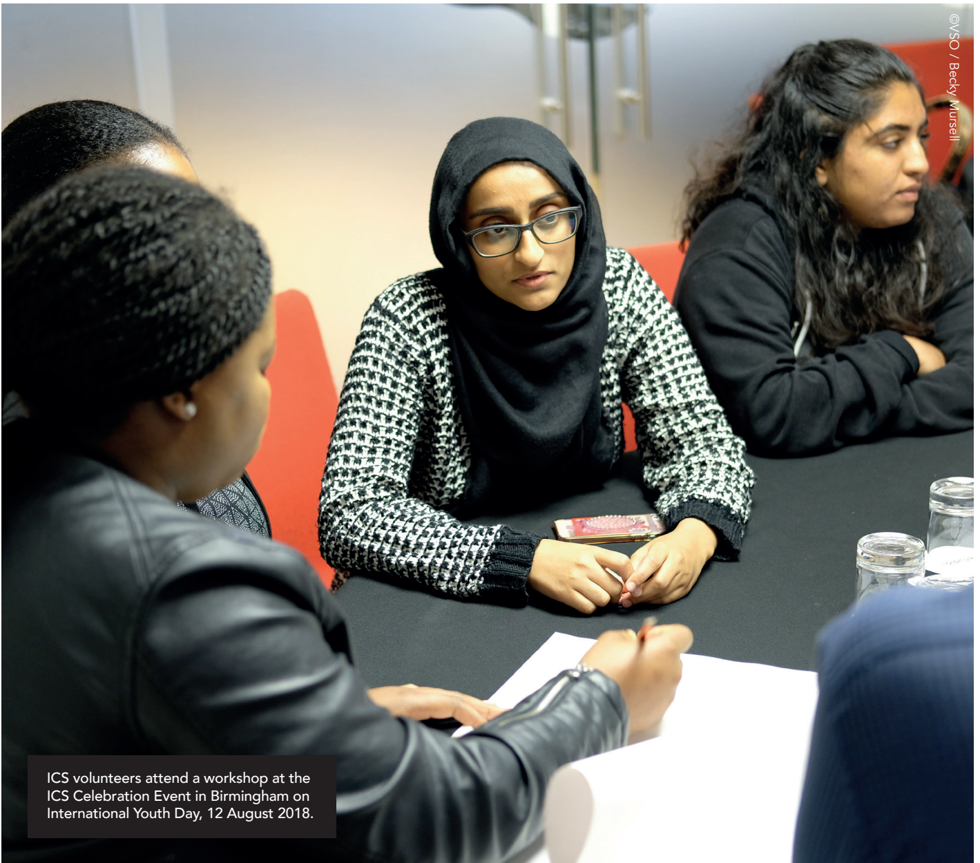
ICS volunteers attend a workshop at the ICS Celebration Event in Birmingham on International Youth Day, 12 August 2018.