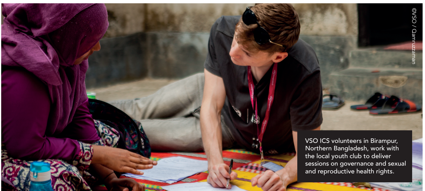
VSO ICS volunteers in Birampur, Northern Bangladesh, work with the local youth club to deliver sessions on governance and sexual and reproductive health rights.

We also interviewed 19 volunteers aged from 18 to 26, including four team leaders. All seven agencies were represented in this sample.