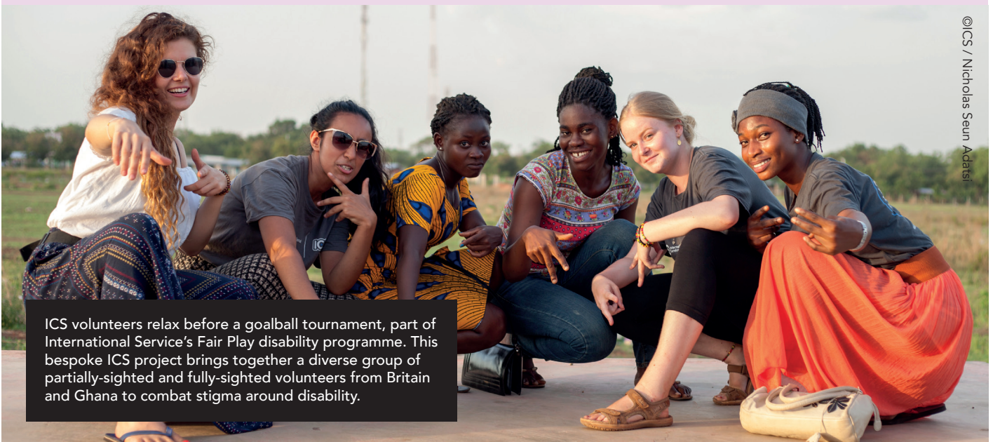
ICS volunteers relax before a goalball tournament, part of International Service's Fair Play disability programme. This bespoke ICS project brings together a diverse group of partially-sighted and fully-sighted volunteers from Britain and Ghana to combat stigma around disability.