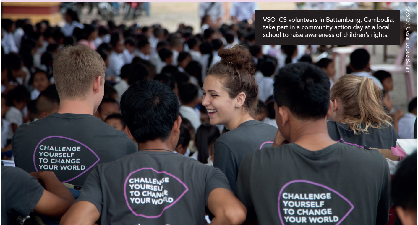
VSO ICS volunteers in Battambang, Cambodia, take part in a community action day at a local school to raise awareness of children's rights.

Recommendation 10: Consider training and support needs for in-country leaders, and crib sheets / aides memoire for common problems.