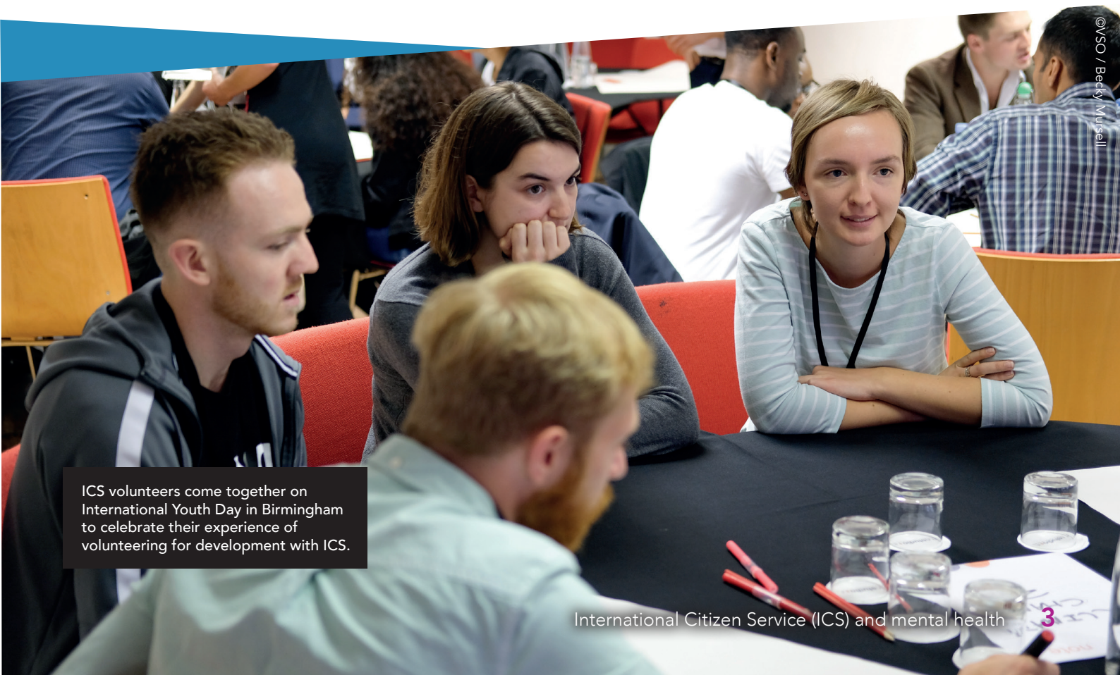
ICS volunteers come together on International Youth Day in Birmingham to celebrate their experience of volunteering for development with ICS.

dropped out. Thirdly, the data collected on mental health problems includes those conditions that had been diagnosed by a healthcare professional, as well as issues that volunteers perceived they had. As such, some data may not be entirely reliable. Finally, some volunteers in the sample may have a history of mental health issues that they chose not to declare in either health screening or the anonymous volunteer survey.