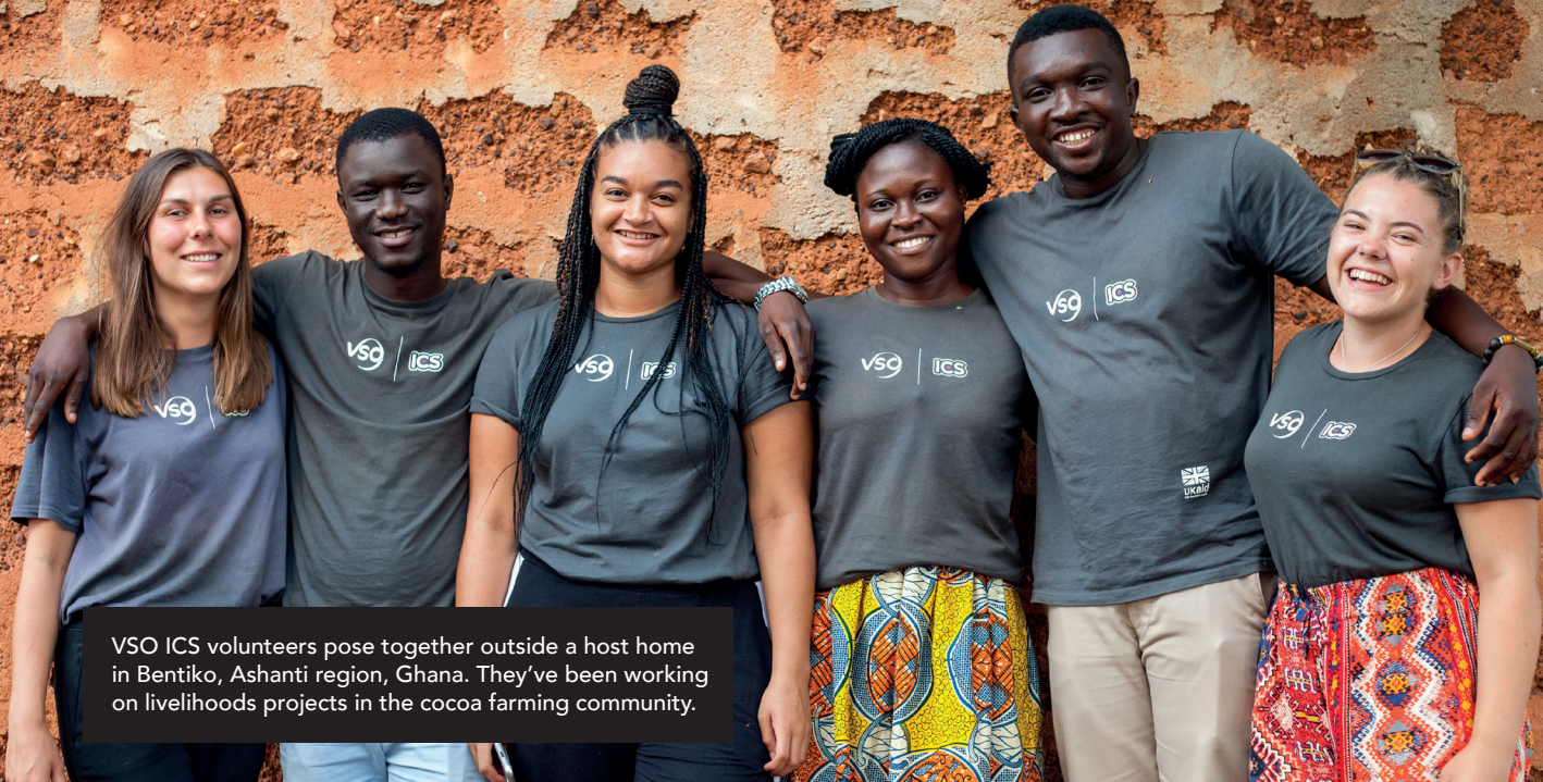
VSO ICS volunteers pose together outside a host home in Bentiko, Ashanti region, Ghana. They've been working on livelihoods projects in the cocoa farming community.