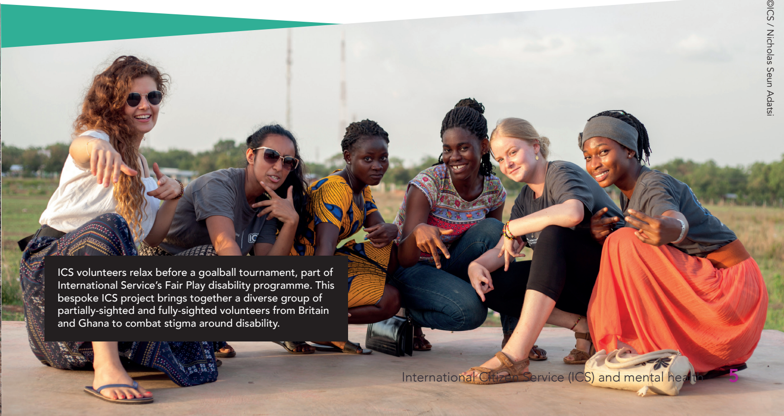
ICS volunteers relax before a goalball tournament, part of International Service's Fair Play disability programme. This bespoke ICS project brings together a diverse group of partially-sighted and fully-sighted volunteers from Britain and Ghana to combat stigma around disability.

Half of all volunteers in the survey said that they needed extra support on placement: from team leaders, other volunteers, and friends and family/support network. A quarter of volunteers who needed support would have liked more than was provided. Many, however, valued the support and guidance they received.